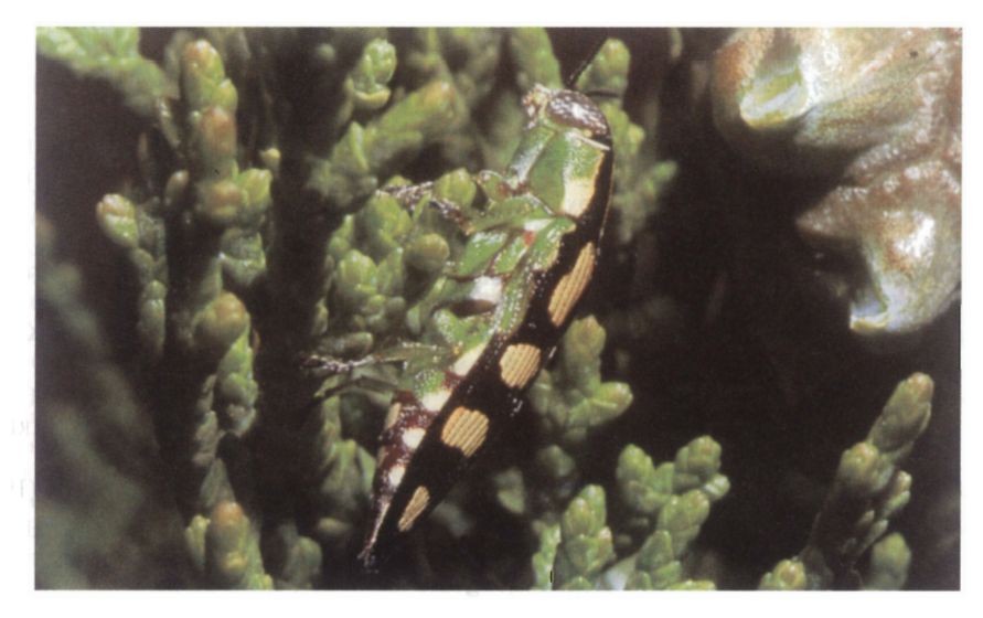
Fig. 3. Diadoxus erythrurus (White): adult in typical resting position on the foliage of its larval host plant, Callitris preissii subsp. verrucosa (Cupressaceae) in the Wurarga district of Western Australia.

HAWKESWOOD & PETERSON (1982) provided a brief review of the biology and hosts of D. erythrurus , and recorded Callitris glaucophylla Thompson & Johnson (cited as C. columel laris F. Muell.) as a host and suggested that the plant association with primitive, arid-adapted conifers (Gymnospermae) indicated that Diadoxus may have evolved during the time when Central Australia was drying out after the Gondwanaland breakup. The utilisation of Callitris and Cupressus was considered by HAWKESWOOD & PETERSON (1982) to be a very ancient association and probably co-evolutionary, without any food-plant shifts to or from other unrelated plant taxa.