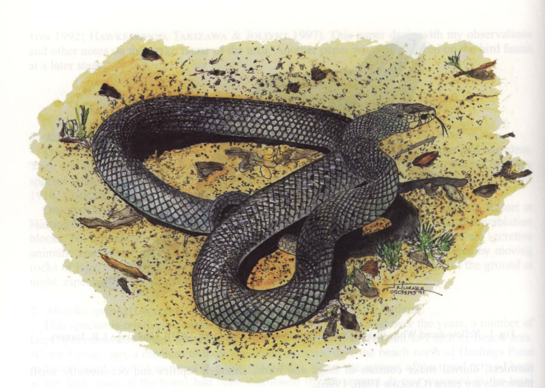
Fig. 2. Eastern Brown Snake [Pseudonaja textilis (Duméril, Bibron & Duméril, 1854)] (Painting: J. R. Turner).

8. Vermicella annulata (Gray, 1841) (Elapidae) [Bandy-bandy].